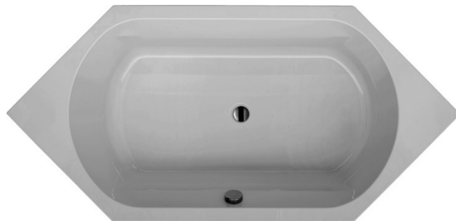
BH 190 S

item No.: 102BWS0301L (overflow left) 102BWS0301R (overflow right) measurement: 1900 x 900 x 450 mm (L x W x H) contains: about 320 l minus people