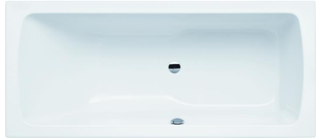
CT 170 D (Ill. Overflow right)