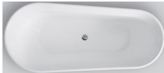
ON 1580/700 M (ill. without overflow)

Manufactured in vacuum - thermoforming process on Aluminum tools. Strengthened with glass fiber reinforced plastic. Manufactured according to DIN EN 198. Laminated floorboard of 12 mm to accommodate the Foot system. Installation with pre-mounted tub feet Floor drain central. Optional with or without overflow. Please note the structural peculiarity of the free-standing bathtubs! (installation instructions) Colors available: black or white